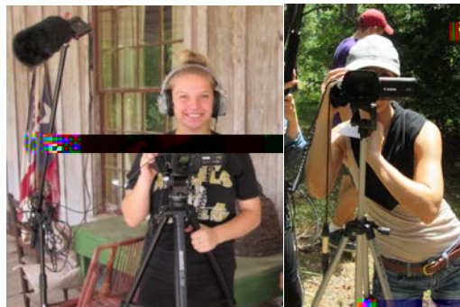
Figure : Cinematographer